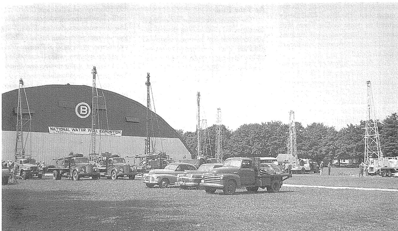
After the Temporary NWWA was formed in 1948 at the National Exposition in Peoria, a welcome banner was hung on the Bradley University Fieldhouse.