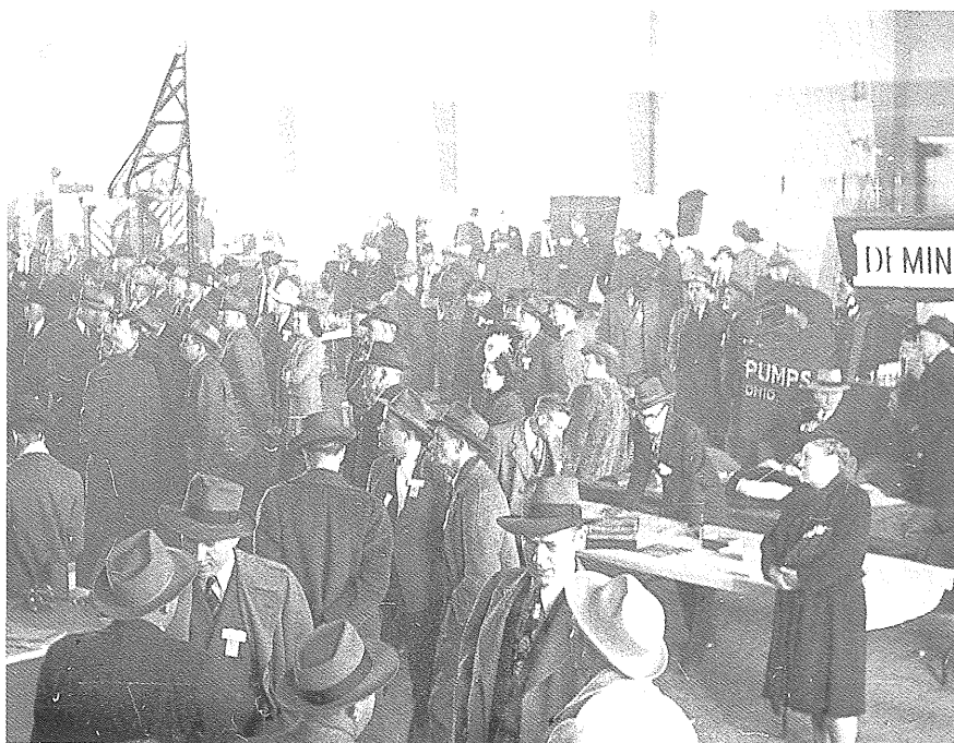
Exhibit floor crowd at the Twentieth Annual Convention in 1947.