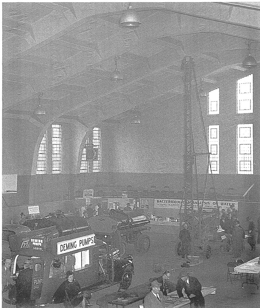
Exhibits in the Urbana Armory at the Illinois Water Well Drillers Association's Twentieth Annual Convention in 1947.